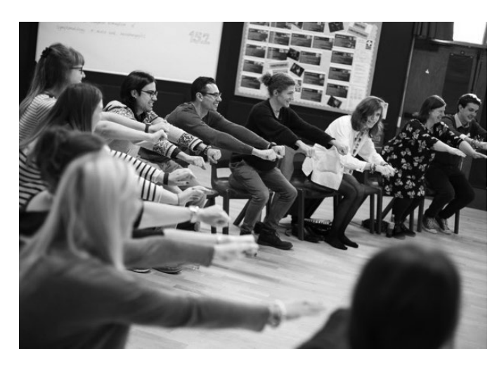
Researchers at a science busking training in the UK

The training was led by the University of Bristol in the UK, Atelier des Jours à Venir in France, and Universitat Autònoma de Barcelona and Universitat Oberta de Catalunya in Spain. In total, 84 early career researchers took part in this training.