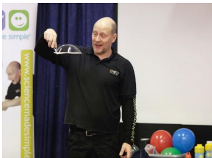
Science busking by Science Made Simple (UK)