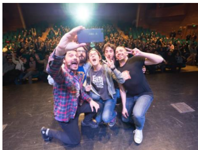
Stand-up comedy by Big Van (Spain)

Performance-based activity is too general a term. In the PERFORM project we have tested three specific approaches: stand-up comedy, science busking, and clowning/improvisational theatre. Are you curious about how they can help secondary school students in the creation of their own scientific performance-based activities?