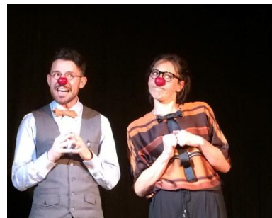
Clown/Improv. by TRACES (France)